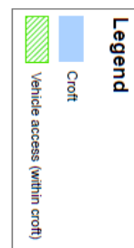
MAP FOR EXAMPLE PURPOSES ONLY